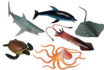
872 ocean animals