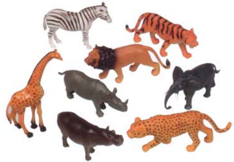
871 zoo animals

⚠ WARNING: CHOKING HAZARD - Small parts. Not for children under 3 years.